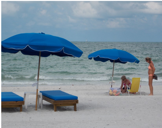
North Redington Beach, Pinellas County