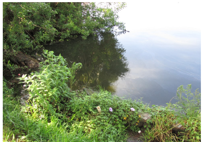
Lunar Lake, Cocoa, Florida by Lela Buis, Orlando Area Poets