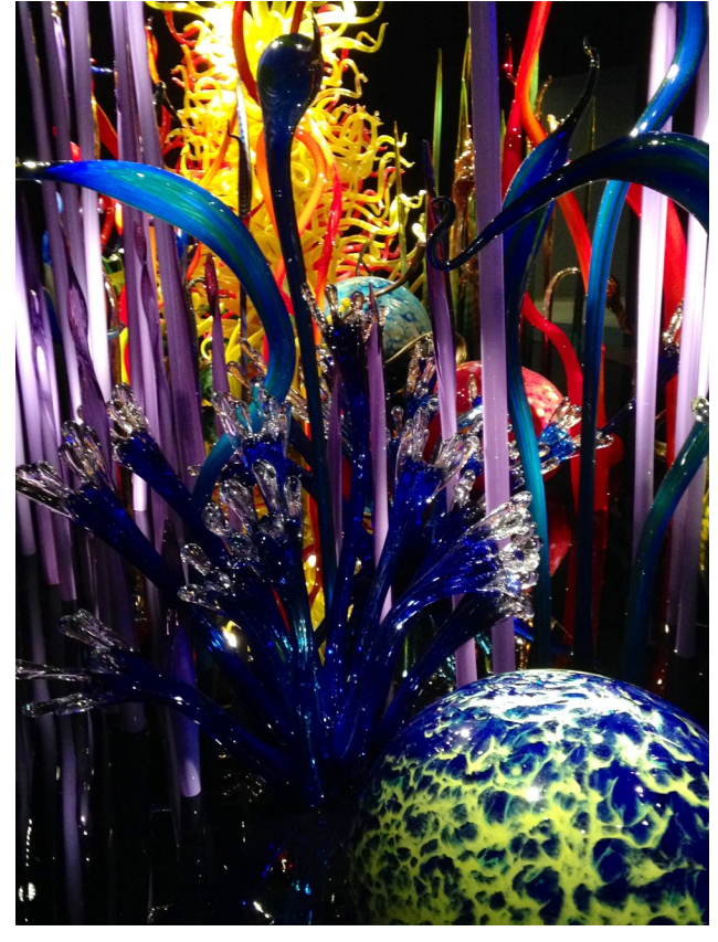
Chihuly 2 by Stan Sujka, Orlando Area Poets