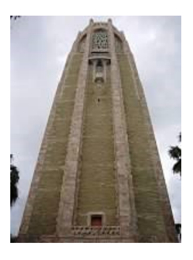
Bok Tower

This year over fifty photographs were submitted to be possibly used in the 2016 Anthology. Unfortunately we had space for only eleven different photos in the book. However, I have decided to showcase many of the non-used submissions in this and other online supplements of OPAP through out the year. I do hope you enjoy seeing your fellow FSPA member's additional talents. This is the second showcase grouping. More coming in April!