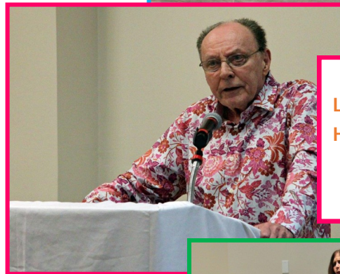
Lee Bennett Hopkins