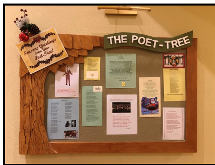
The 'Poet Tree' at Freedom Plaza